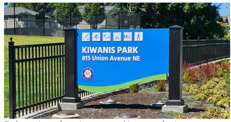
Enhancing the cityscape: New park signage throughout Renton

Registration is open for this action-packed, family-friendly event. Tickets are $20 for ages 17 and under and $30 for ages 18 and older. Registration ends Friday, September 15.