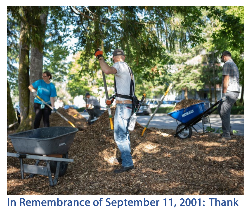
you to our 2023 Day of Service volunteers Many volunteers dedicated their Saturday morning to

For more information on the upcoming webinar, visit SoundTransit's website.